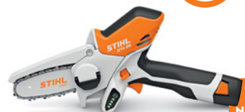
GTA 26 BATTERY GARDEN PRUNER

GIVE THE GIFT OF GARDENING 30+ IDEAS INSIDE!