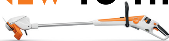
NEW FSA 30 BATTERY GRASS TRIMMER