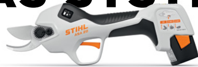
NEW ASA 20 BATTERY SECATEURS